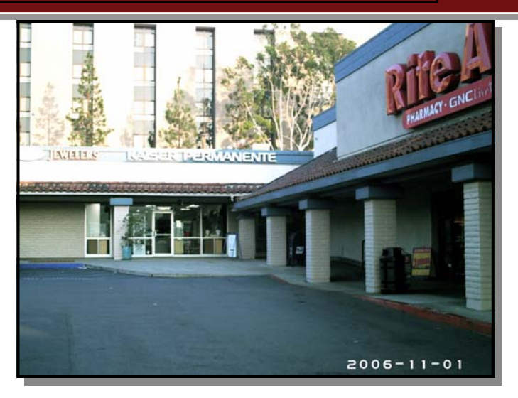
SEC Mission Gorge and Zion Avenue

TRAFFIC COUNT: Mission Gorge Rd.: 31,000 Zion Avenue: 19,000 (cars per day, SANDAG) Total: 50,000