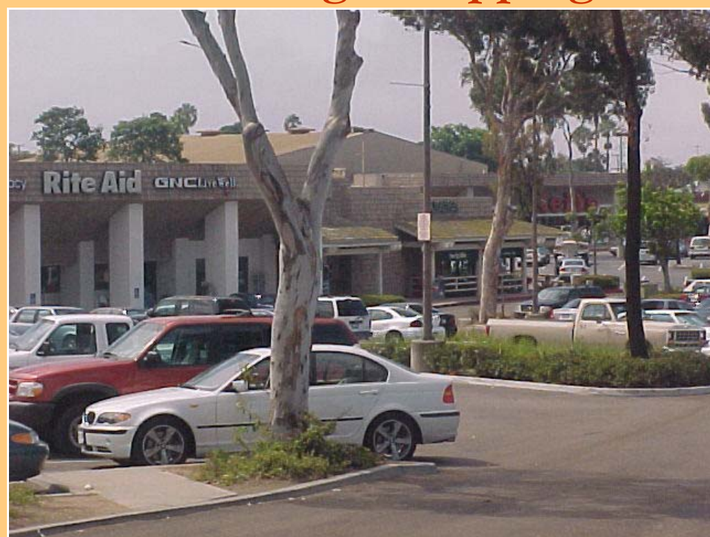
SEC of Clairemont Drive and Burgener Blvd. San Diego, CA 92117