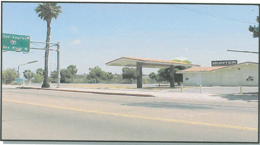
1227 Vista Way Oceanside, CA